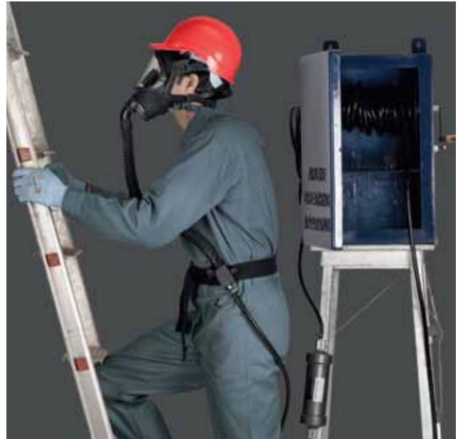
Airline System With FRP Wall Mounted Cabinet

The apparatus consists of a waist belt with an airline belt manifold. This incorporates a MINI-REGULATOR to which the air supply